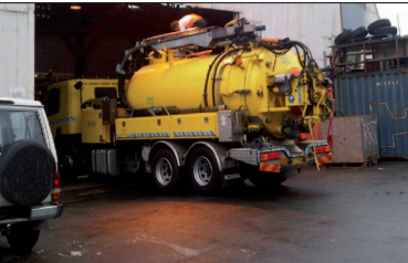
A Sydney Water truck undergoing quarantine