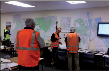
Staff in the operations room