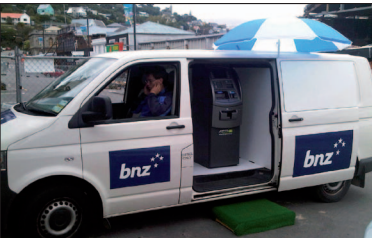
Banking facilities - Christchurch style